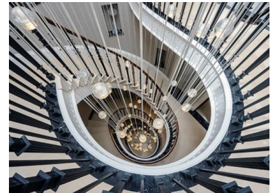
Queen's Ride Staircase

Join us as we explore this valued Perspective – a masterful expression of Sam's art!