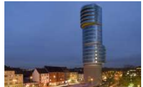
Exzenterhaus Bochum, Germany