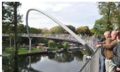
Rathenow Pedestrian Bridge, Germany