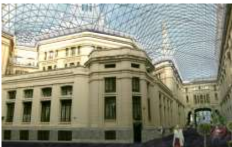
Roof for Palacio de Comunicaciones, Spain