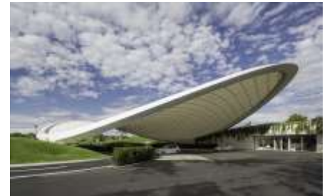
VW Autostadt, Wolfsburg, Germany