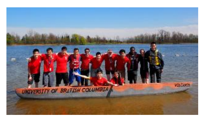
The UBC Concrete Canoe Team

While races were cancelled this year in the Pacific Northwest Regional competition in Klamath Falls, Oregon, due to severe winds, the team placed 8th at the Canadian Nationals competition in Waterloo.