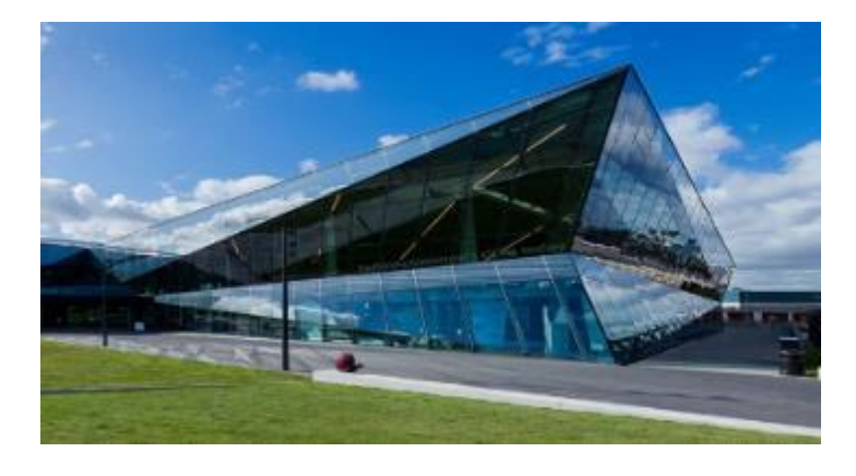
The Crystal – London, UK

The Council meetings were held remote from the Institution at the Crystal, a new sustainable development in the Docklands area of London. This attractive building proved to be a great venue for the meeting sessions. The networking dinner was a barbeque held on the deck of the stylish Sunborn Yacht Hotel, moored nearby.