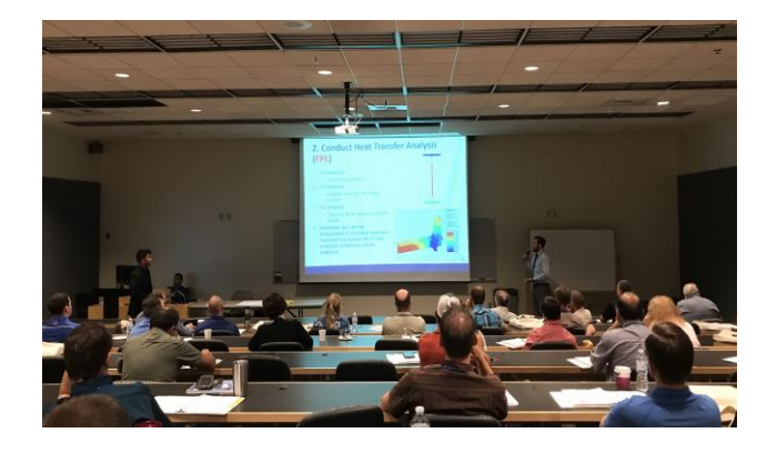
Conference Delegates learn about heat transfer analysis in Structural Fire Protection