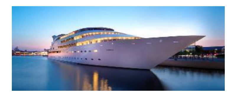
Sunborn Yacht Hotel – London, UK