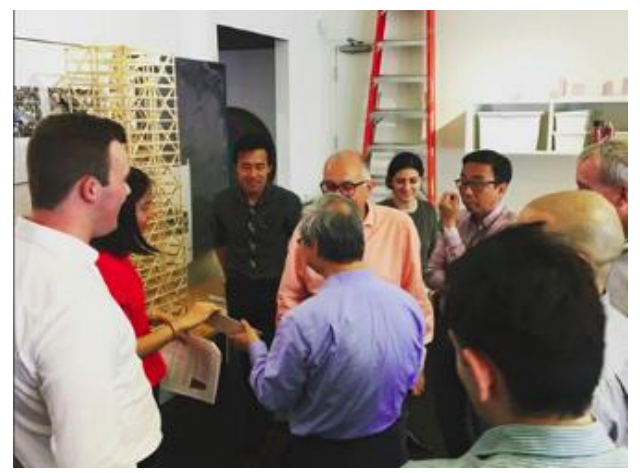
The UBC EERI Team

The UBC EERI Seismic Design Competition Team is currently constructing and assembling their model in preparation for the 2018 EERI Seismic Design Competition in Los Angeles. This international competition will see the UBC team competing against teams from around the world including the United States, Turkey, and Bucharest.