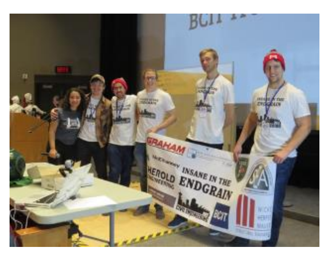
The "Insane in the Endgrain" Team

With the help of funds received from SEABC YMG, the BCIT Troitsky team gained a lot of valuable insight that will be put to good use by the 2019 BCIT Troitskty team.