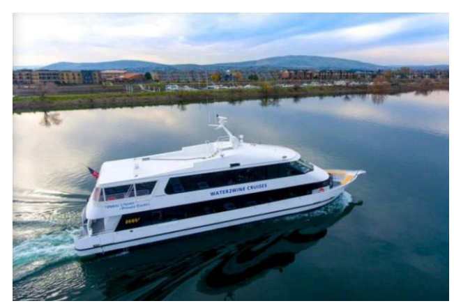
Water-to-Wine Cruise, Richland, OR

The 2019 Northwest Conference will be held next July in Portland, OR – look out for announcements, I hope to see you there.