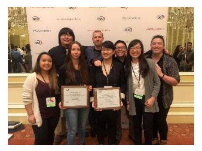
2018 CSCE BCIT FRC Bowling Ball Competition Team in Salt Lake City, UT