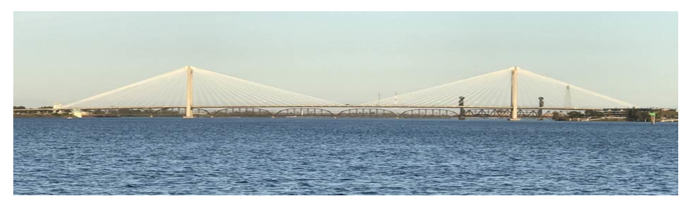
Ed Hendler Bridge with the Pasco-Kennewick Northern Pacific Railroad Bridge Downstream