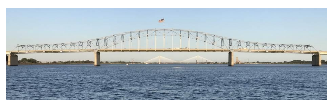
Pioneer Memorial Bridge with Ed Hendler Bridge Downstream