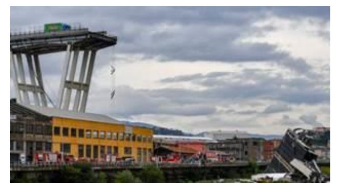
Aftermath of Morandi Bridge Collapse

On August 14 in Genoa, Italy, a section of the Morandi Bridge including the westernmost tower failed during a violent storm. It was reported that lightening struck the bridge. At least 39 people died and many more are missing. The bridge was one of the major links to France and its failure will have a massive economic impact. The 1182 m long multispan bridge was built between 1963 and 1967 and opened on 4 September 1967. Named after its prominent designer, Professor Riccardo Morandi, the bridge, with its roadway some 45 m above grade, is an icon in the port city. Morandi designed several similar structures during that era – the closest to home being the Kinnaird Bridge in Castlegar, BC. While the Morandi Bridge and several others were early cable-stayed bridges, the Kinnaird Bridge is a multi-span girder bridge.