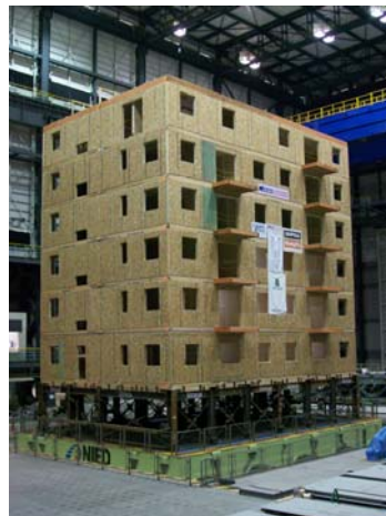
Full-scale, 6-storey wood-frame test building on a one-storey steel braced frame on the shake table