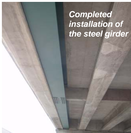
Completed installation of the steel girder

Following installation the steel girder was shimmed against the deck and preloaded by suspending weights near mid-span, followed by grouting of the gap between steel girder and bridge deck. The preloading was to