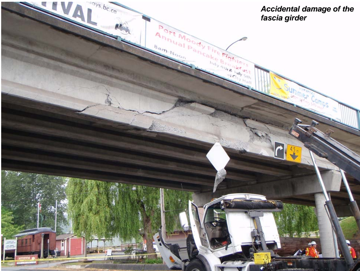
Accidental damage of the fascia girder

have required a considerable amount of deck to be removed which would have triggered an investigation into the safety of the partially-demolished bridge under traffic.