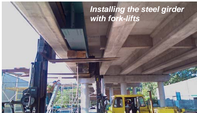
Installing the steel girder with fork-lifts

Following installation the steel girder was shimmed against the deck and preloaded by suspending weights near mid-span, followed by grouting of the gap between steel girder and bridge deck. The preloading was to